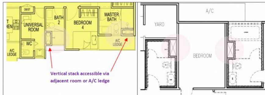
Figure 2: Alternative layouts that allow the vertical stack to be accessed for future maintenance from the air-conditioning ledge or an adjacent room.